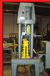
WA Whitney 765 Shear with Angle Iron Die