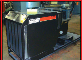
Hypertherm HP 2000 Plasma NEW!