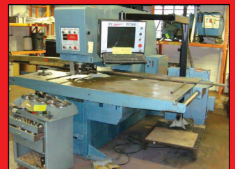
WA Whitney 653 Fabricator w/ PC800 Control

Unique Offering of Machinery and Equipment Surplus to A Premier Rebuilder and Service Company of WA Whitney Fabricating Equipment. Hard to Find Parts, Attachments and Tooling