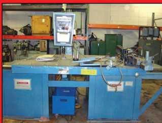
WA Whitney 100 Ton Hevi-Plate Duplicator