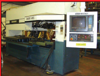
WA Whitney 3500 ATC, 40 Ton Punch/Plasma Machine