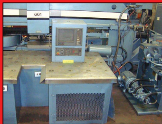
WA Whitney 661, Punch/Plasma Machine