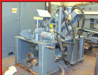
WA Whitney 846 Anglematic Beam Processing Machine